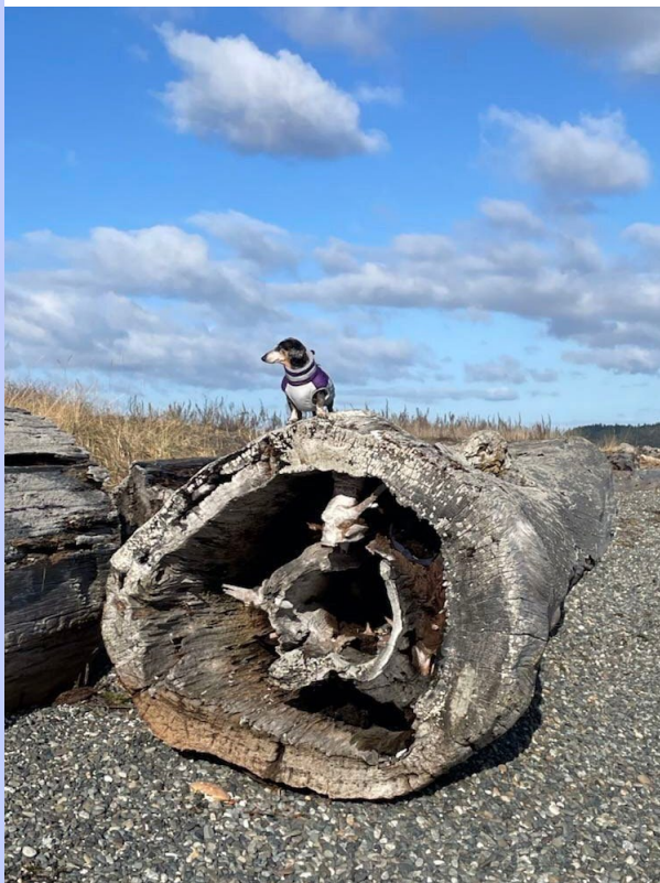
Daisy at the Beach