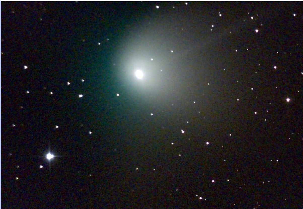
Comet as seen from Kala Point