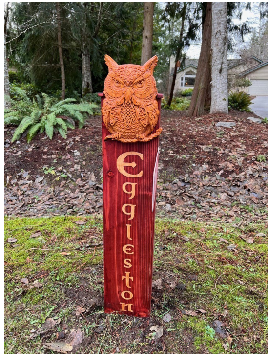
Neighborhood Artisan: photo by Donna Abear