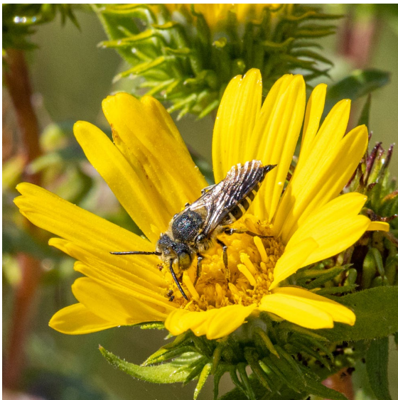
Cuckoo Leaf Cutter Female

I can't wait for all the colors of spring at Kala Point — and more bee watching! ♦