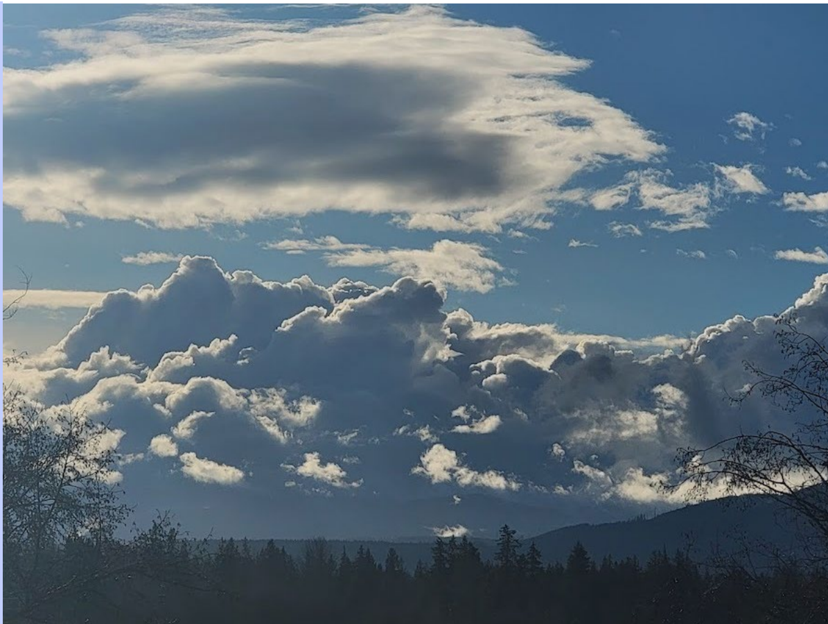
Clouds over the Olympics