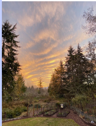
Sunset Glory

Be on the lookout for the Kala Point Survey in your email inbox this month. There are a few subjects on which we would like your input on this year: