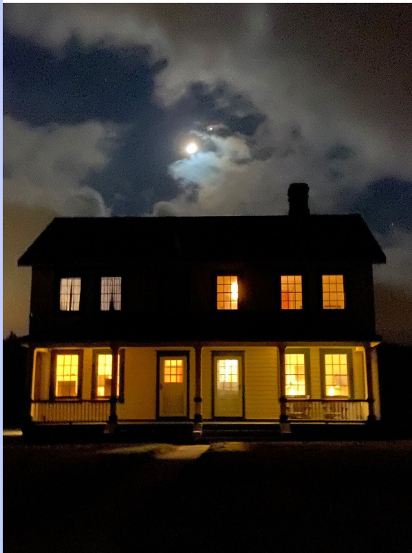
Fort Worden Lighted House