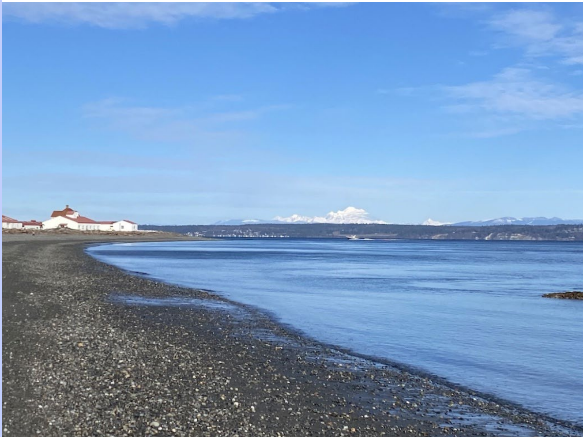
Magnificent Mt Baker