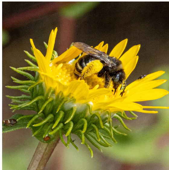
Long Horned Female