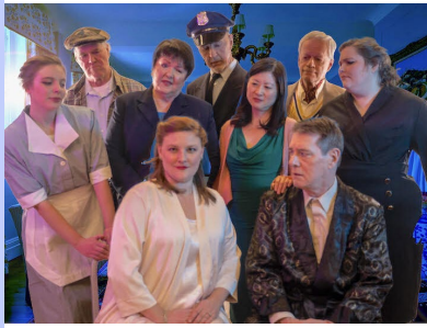
The Ludlow Village Players

Powell, who provided the following account.