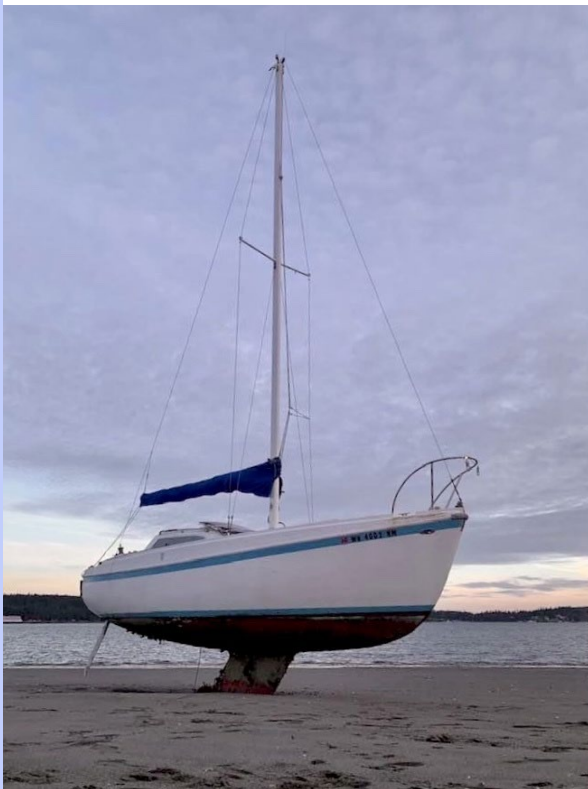
High and Dry