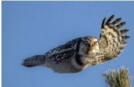
When you drive by anyone in Kala Point, you must wave.