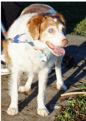
"Sweet Millie"