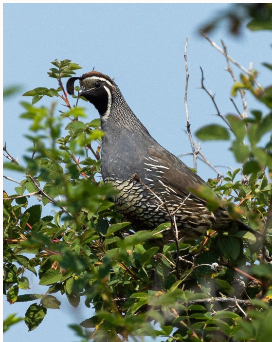
Cali Quail at KP Beach: Kris Ethington