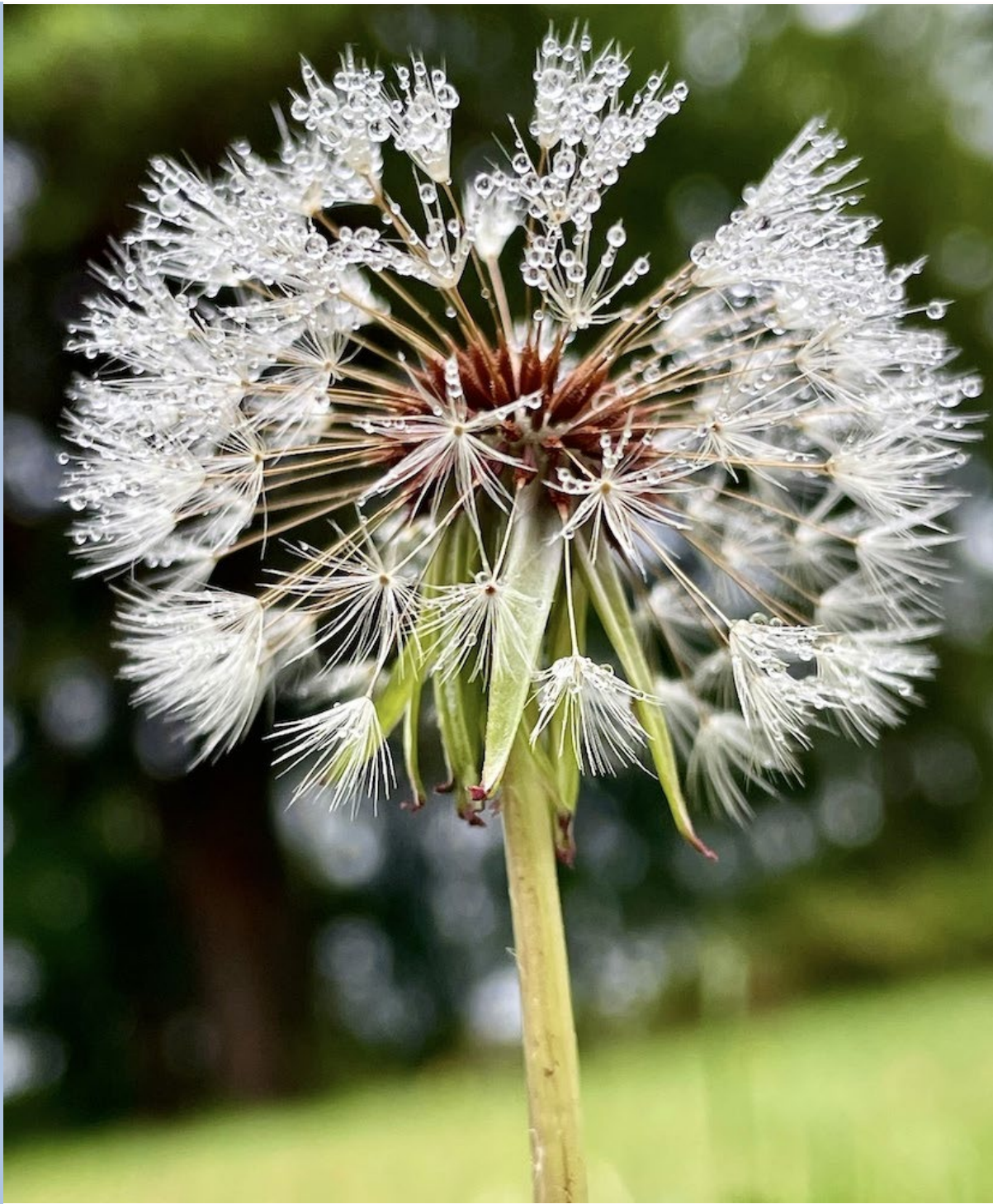
Moist September Morning; Alison Ebot