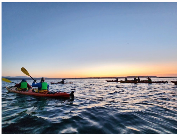
Some of the fun activities we did included:

In July, I arranged for my nephews' families to gather in Port Townsend for a week. Kala Point Village was perfect for our week-long reunion!