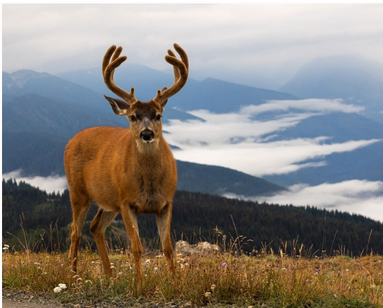
Buck at Hurricane Ridge: Kris Ethington