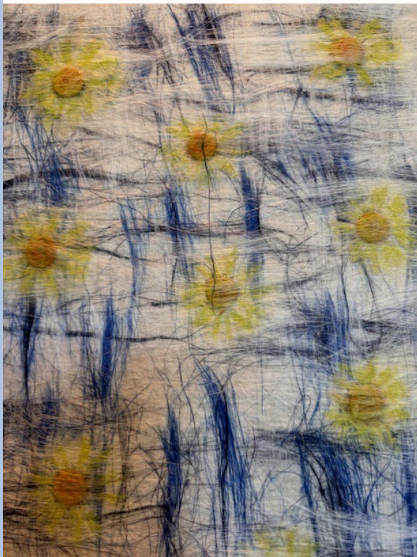
Cynthia LaRouge Textile Art